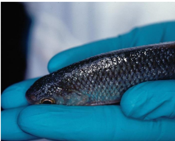
Roach with a heavy whitespot infection

Whitespot is very damaging to the gills and skin. In heavily infected fish it can cause a rapid loss of condition, considerable distress and death. Infected fish have small white spots on the skin and gills and produce excess mucus, due to irritation. Whitespot causes most damage when entering and leaving the tissues of the fish. This can lead to the loss of skin and ulcers. These wounds can harm the ability of a fish to control the movement of water into its body. Damage caused to the gill tissue of an infected fish can also reduce respiratory efficiency. This means it is more difficult for the fish to obtain oxygen from the water, and becomes less tolerant to low levels of dissolved oxygen.