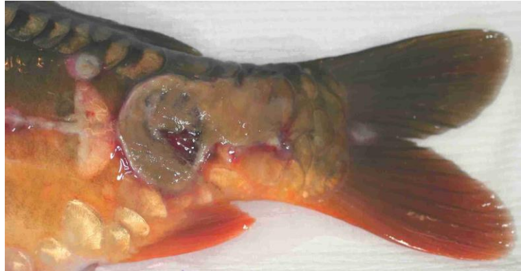
A fungal infection covering an open wound

Healthy fish do not get infected by fungi, and as such good fishery management is crucial to avoid outbreaks from occurring in the first place. Measures include: