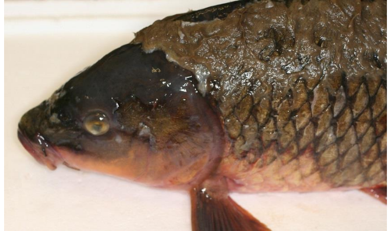
A fungal infection on a common carp

Fungi are common in aquatic environments, especially where there is a lot of decaying organic matter (such as plant litter and uneaten food). A fungus normally grows as a system (known as mycelium) of branching stems (individually known as hypha). They can infect most freshwater fish species including carp, perch, roach, tench, pike, salmon and trout.