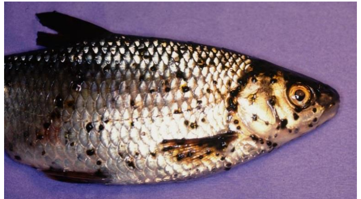
A fish with a heavy blackspot infection

Blackspot may be one of the easiest parasites to spot on fish, but unless it is infecting the fish in large numbers, it shouldn't be of concern.