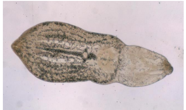
A blackspot parasite removed from its cyst

Blackspot is the name given to the cyst formed around the larval stage of the parasite Posthodiplostomum cuticola . This is a flatworm which has more than one host and a complicated life cycle. It is found in the skin, fins and gills of most freshwater fish. The black colour comes from a pigment, produced by the fish, in the tissue around the cyst. This pigmented cyst, which gives the parasite its common name, is clearly visible to the naked eye.